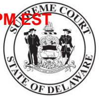
Exhibit 1: List of Amici